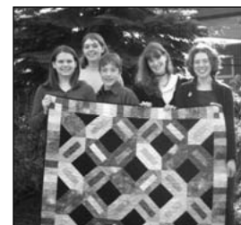
With a grant from the Student All-Star Program, Yelm students created quilts to raise funds for Dollars for Scholars

For more information, eligibility standards and to download applications visit www.Seahawks.com and click on the Community section.