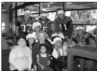
The Captains' Blitz group with some new Seahawks fans

Running back Shaun Alexander made a surprise appearance and gave Coach Holmgren a little break from ringing the bell.