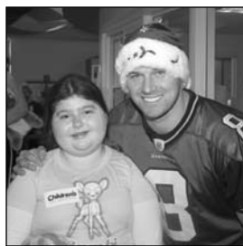
Matt Hasselbeck hangs with a new friend

Since 1978, the Captains' Blitz program has been encouraging folks who are going through tough times. The holiday season is a difficult time for many families who may have loved ones in the hospital.